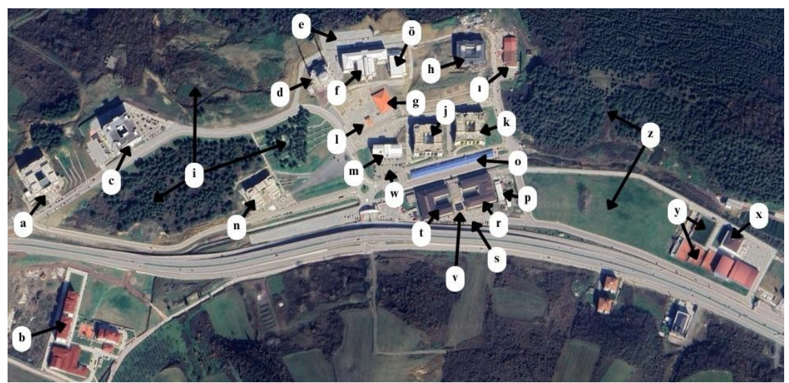
Figure 1. Yalova University Campus satellite image Buildings shown with letters in the figure letters a, n, f, h, k, j, r, o, t, classrooms and academic buildings