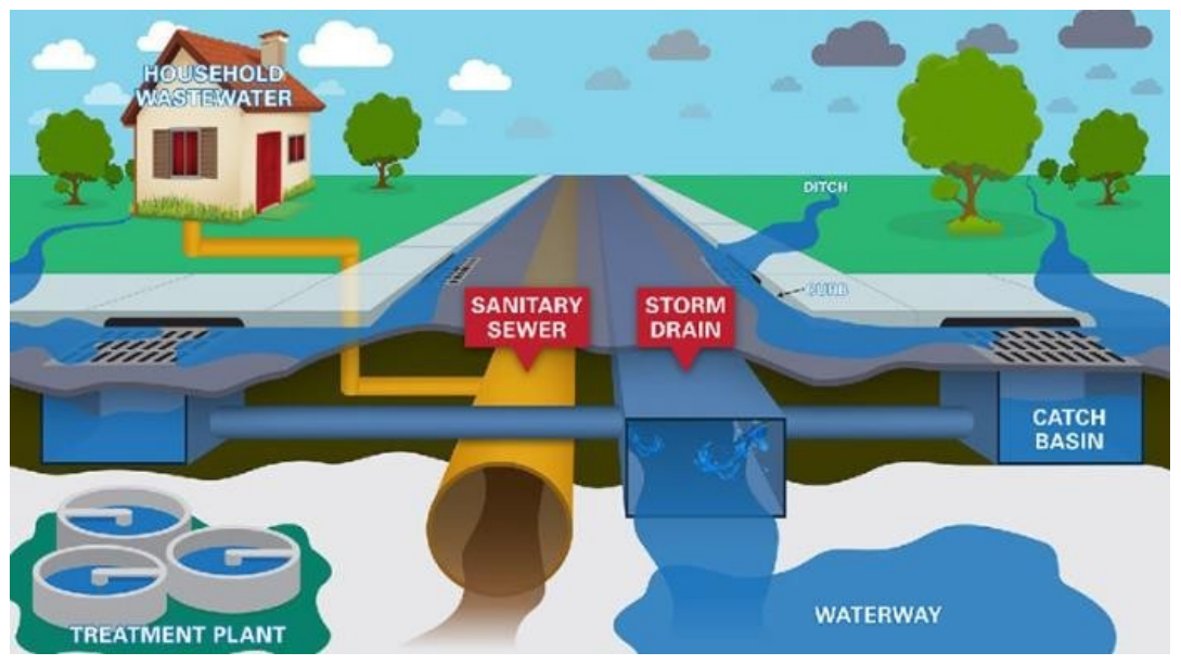
Figure 2. Wastewater storage system [21].